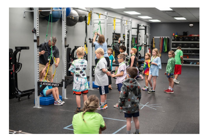
Camp LMU served approximately 65-70 rising Pre-K through 8th grade students. The LMU STEM camp served 55 1st through 12th grade students.