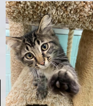
Figure 2: Cat reaching paw out Animal Adoption Foundation